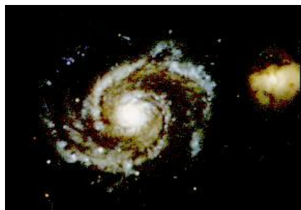
The Whirlpool Galaxy