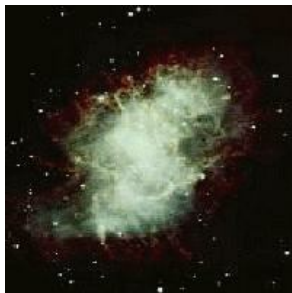
The Crab Nebula