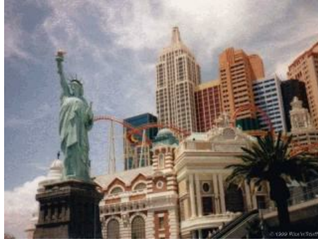
New York Casino, Las Vegas