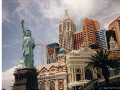
New York Casino, Las Vegas