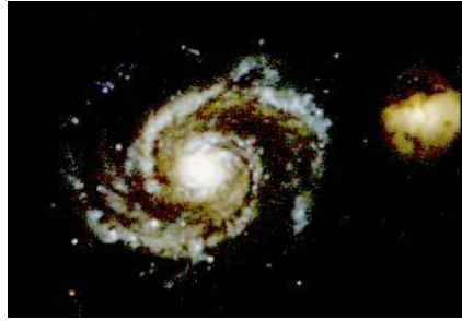
The Whirlpool Galaxy